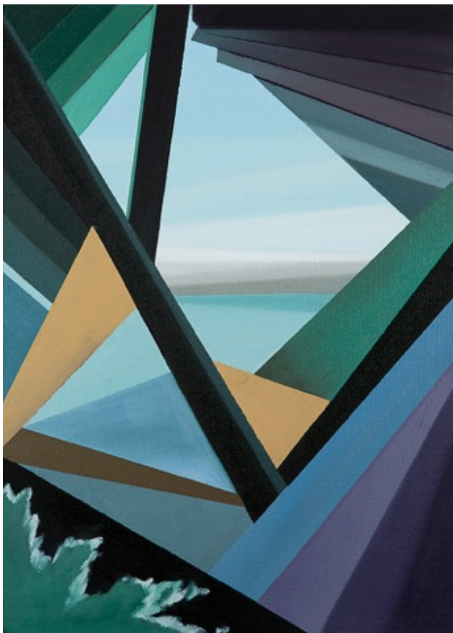
Platform 2018 oil on canvas 30 x 25 cm