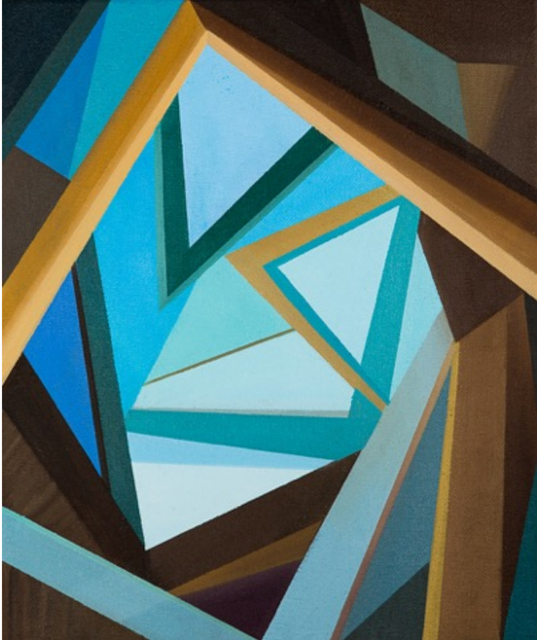
Frames 2018 oil on canvas 35 x 25 cm