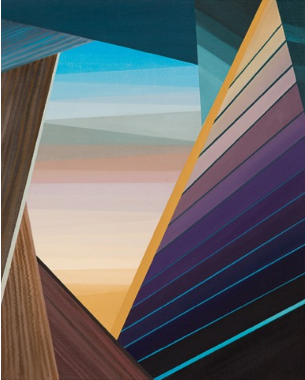
Purple shutter 2018 oil on canvas 50 x 40 cm