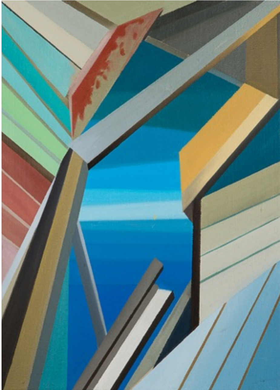
Collapsing 2018 oil on canvas 30 x 25 cm