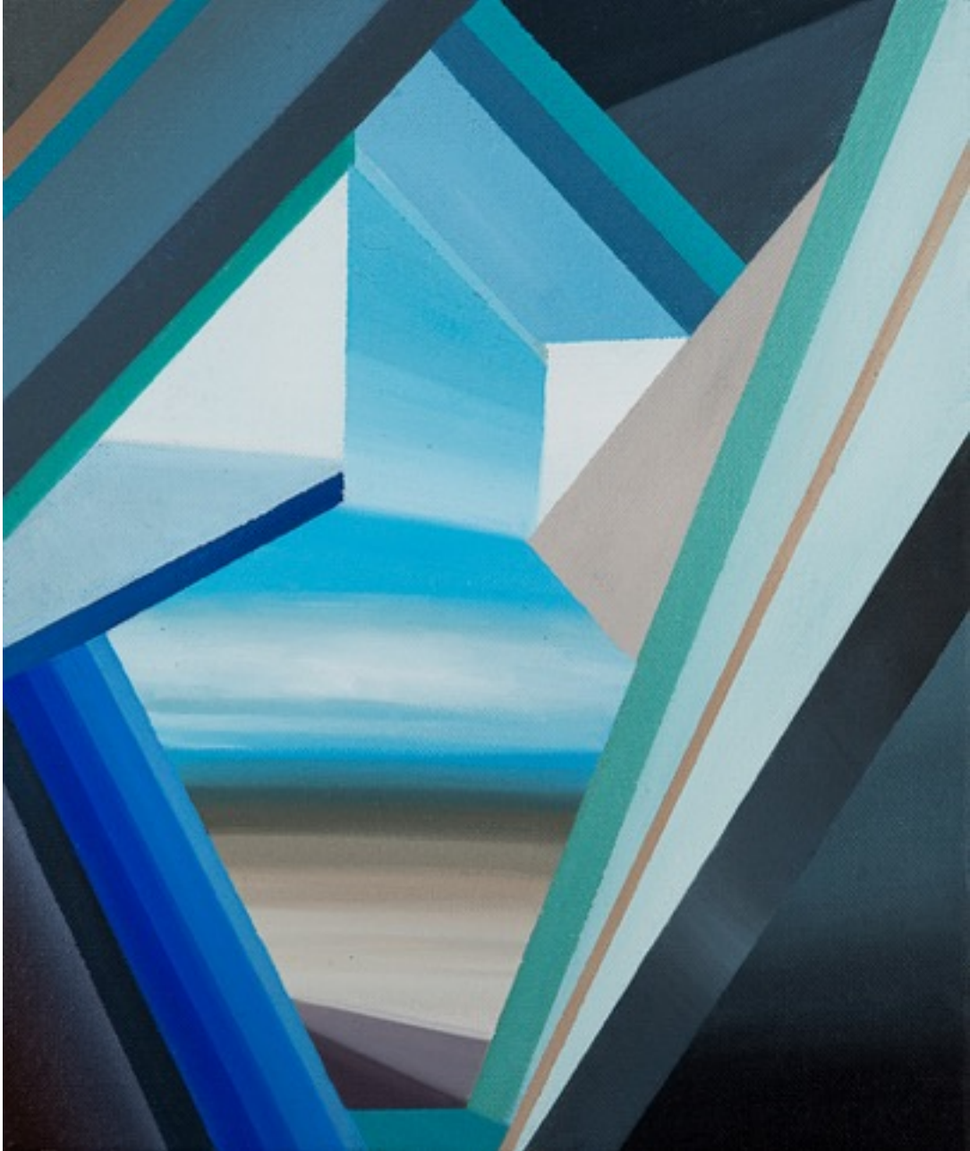
Dreidel 2018 oil on canvas 30 x 25 cm