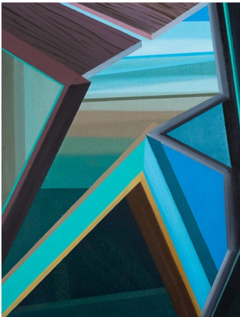
The Pipe 2018 oil on canvas 40 x 30 cm