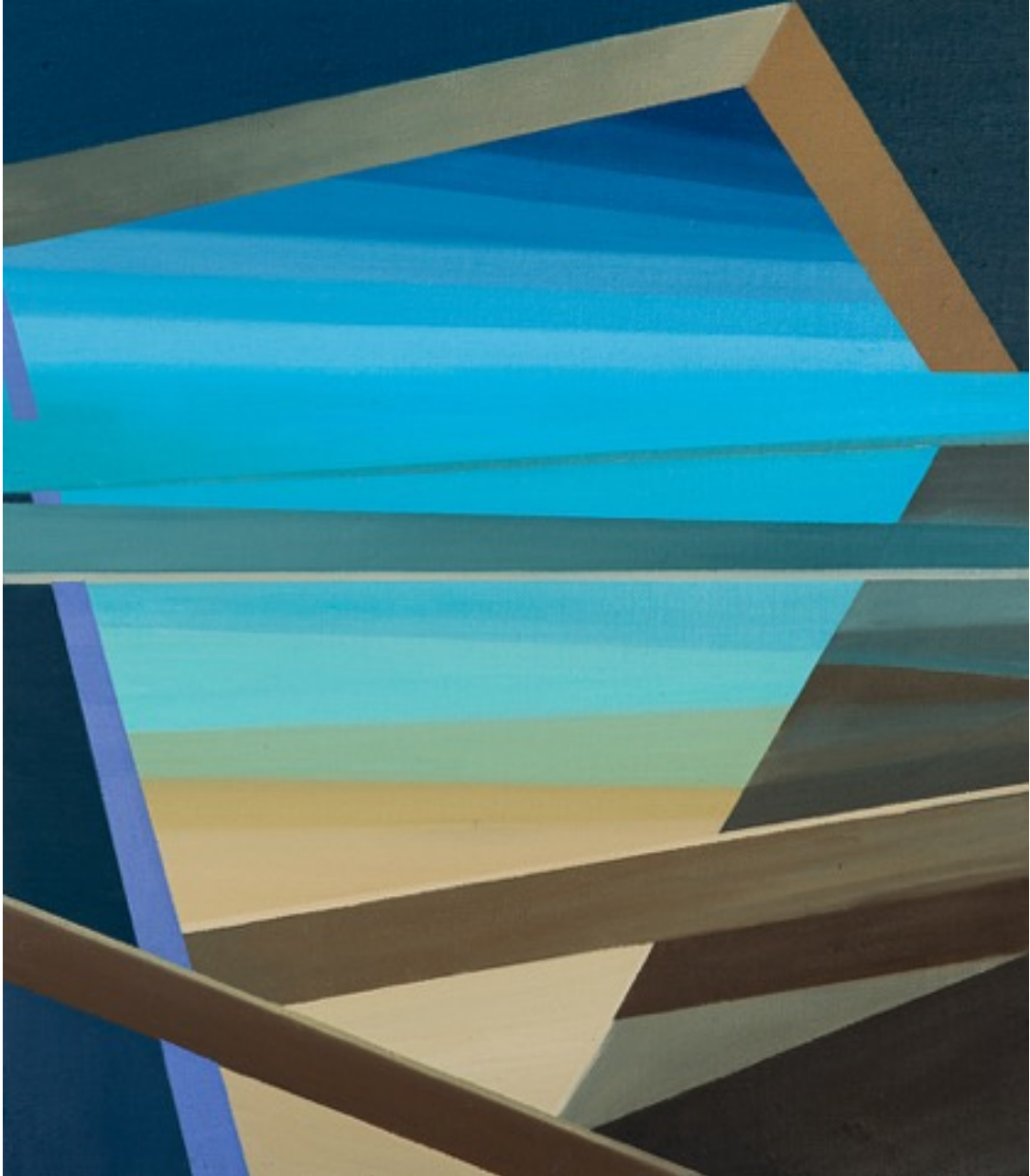
Obstruction 2018 oil on canvas 45 x 35 cm