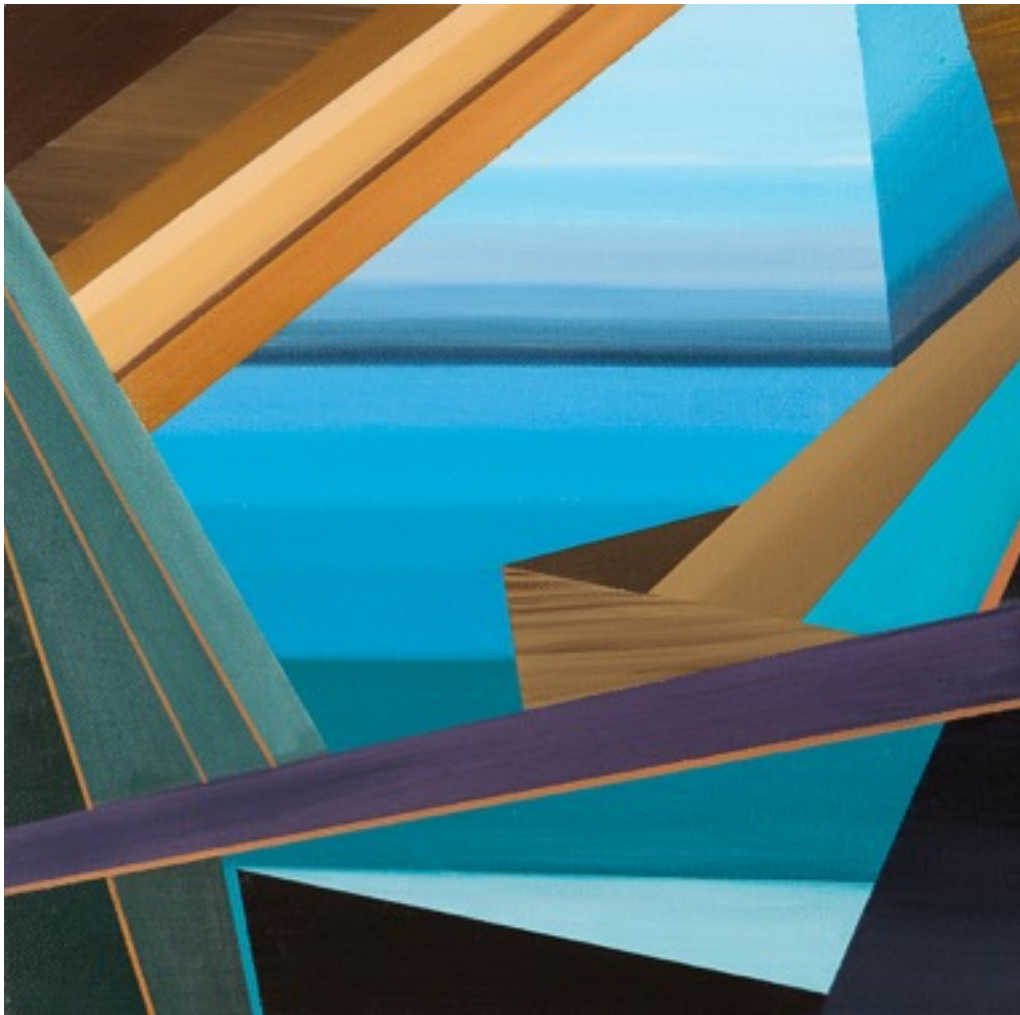
Square View 2018 oil on canvas 25 x 25 cm