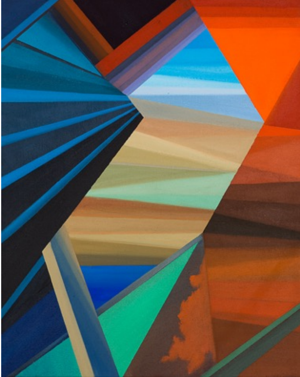
Heart 2018 oil on canvas 50 x 40 cm