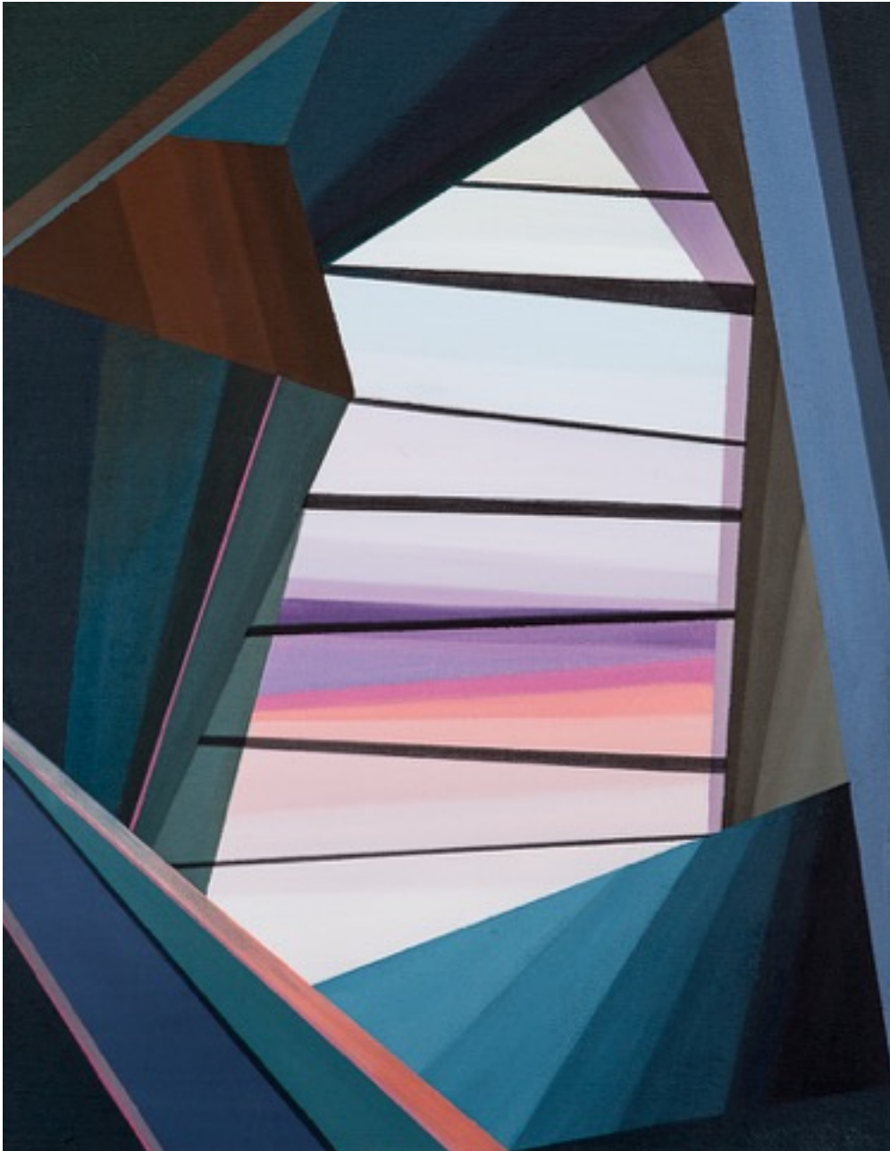
Bars 2018 oil on canvas 45 x 35 cm