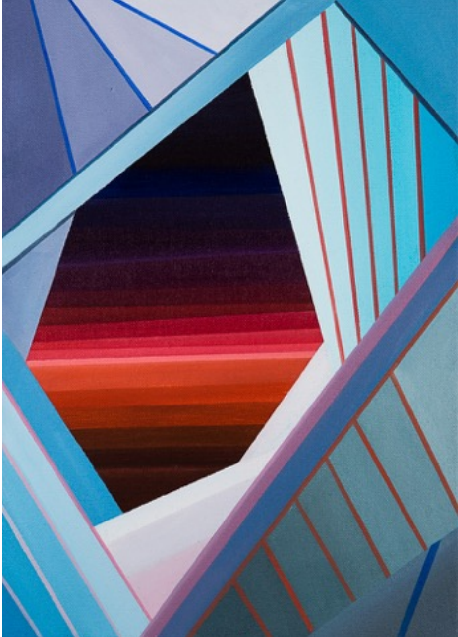
Sunset 2018 oil on canvas 40 x 30 cm