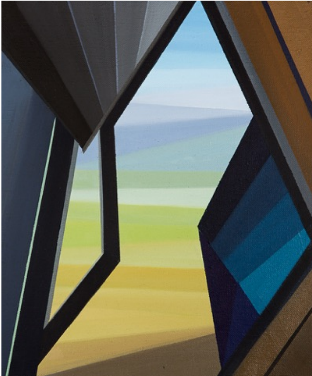
Yellow stretch 2018 oil on canvas 30 x 25 cm