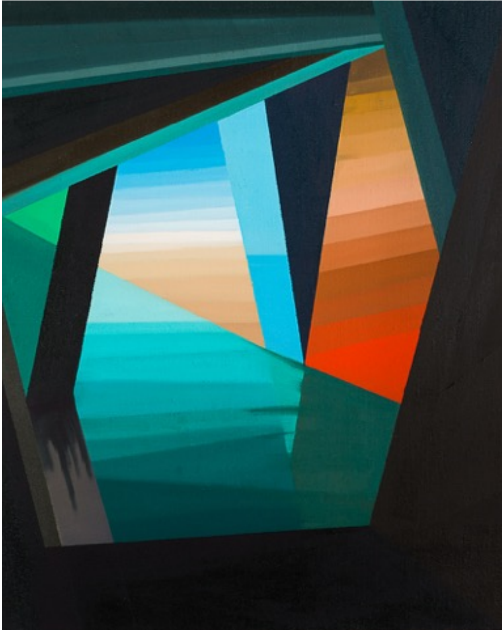
Green curtain 2018 oil on canvas 50 x 40 cm