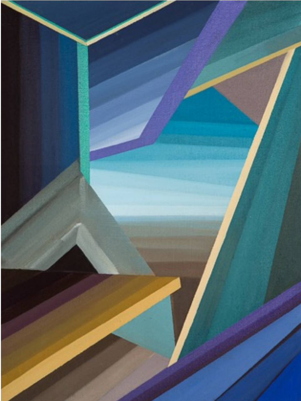
The Fire Place 2018 oil on canvas 40 x 30 cm