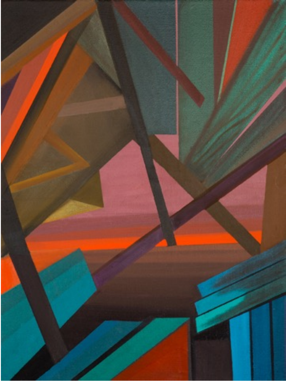
Balagan 2018 oil on canvas 40 x 30 cm