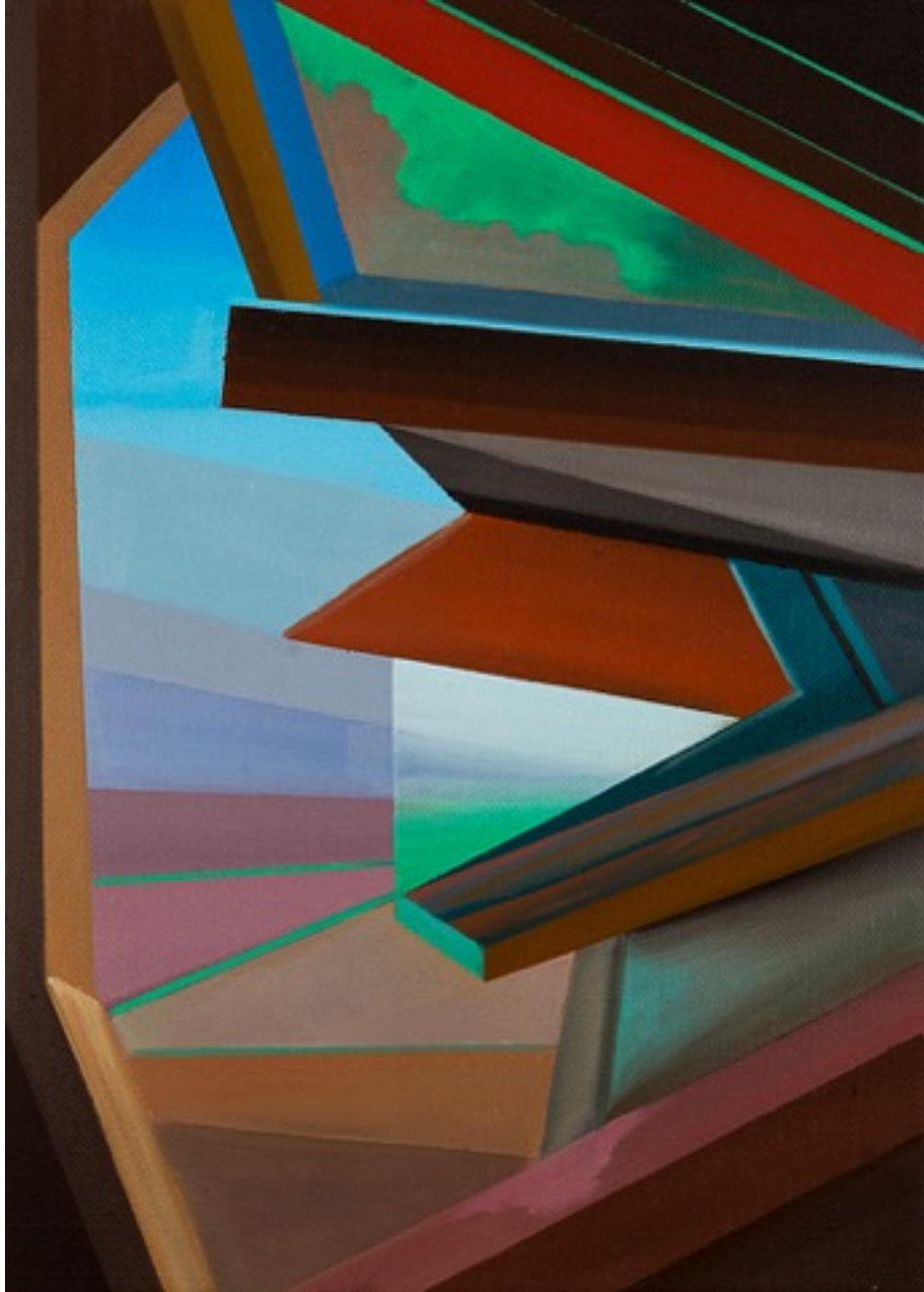
House 2018 oil on canvas 35 x 25 cm