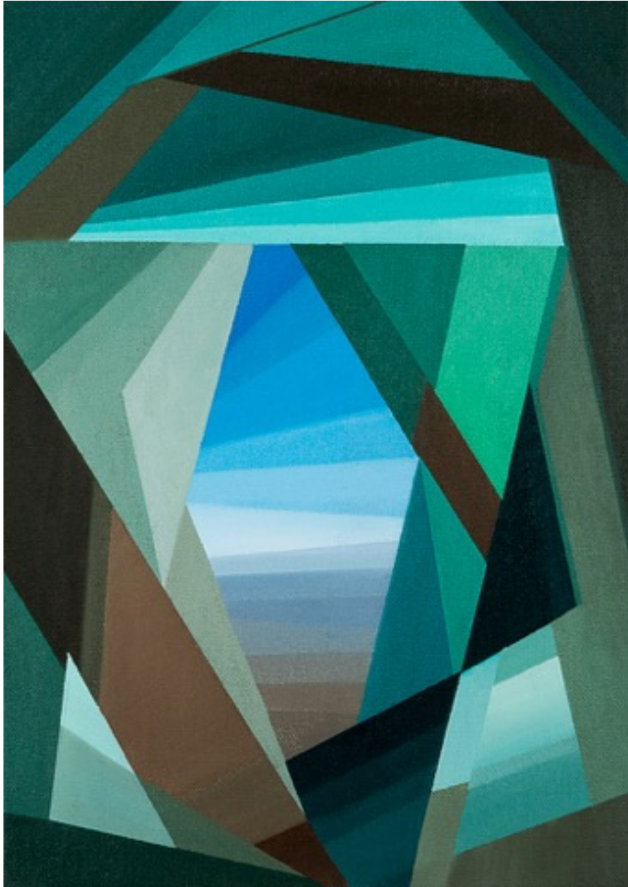
Blue Sky 2018 oil on canvas 35 x 25 cm