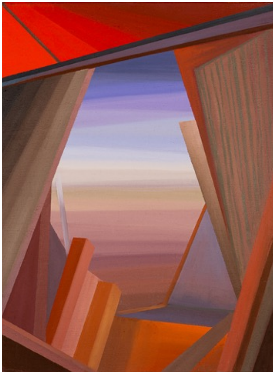
Red roof 2018 oil on canvas 40 x 30 cm